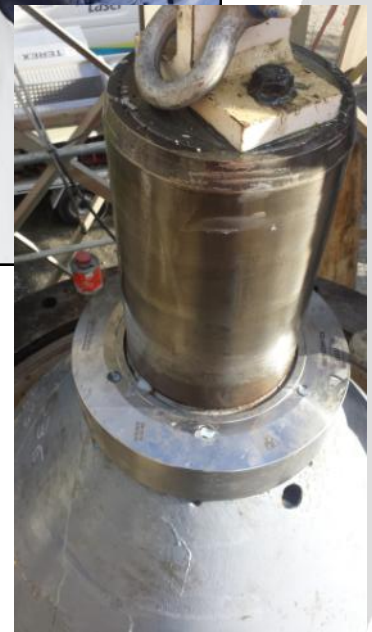
Sacrificial cover installed and the unit is now ready for service.