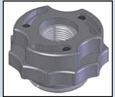
Above Left - Open Tri-Nut Above middle: Tri-Nut Closed Right - Complete Tri-Nut